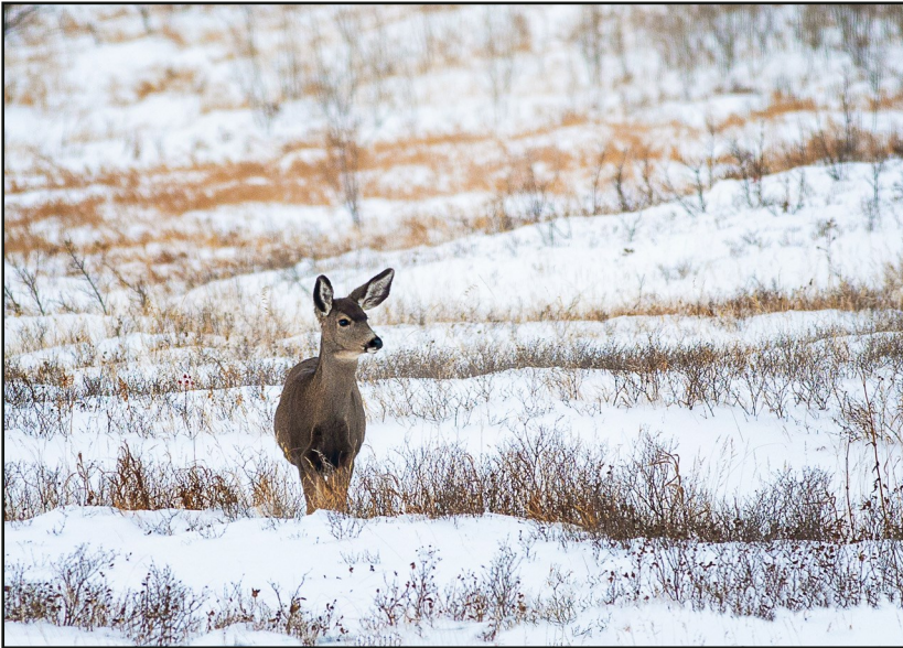
Photo taken in the Northeast Swale